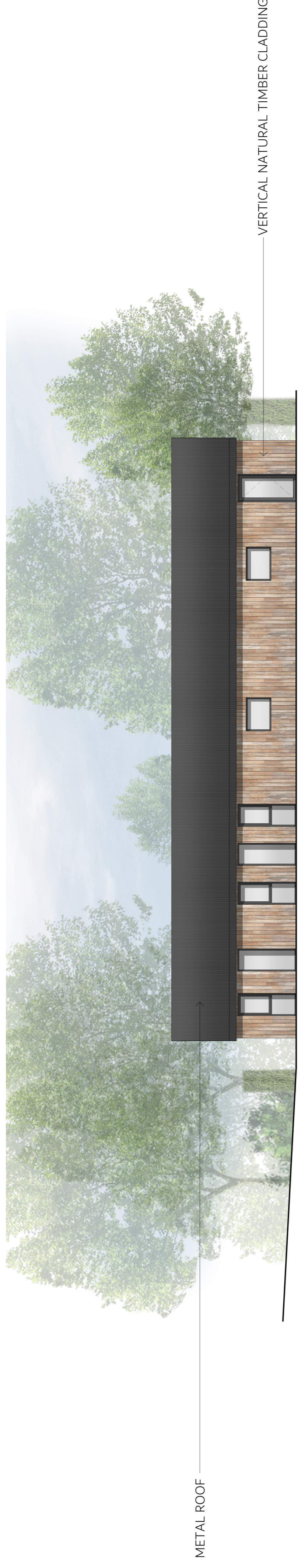
PROPOSED NORTH EAST ELEVATION